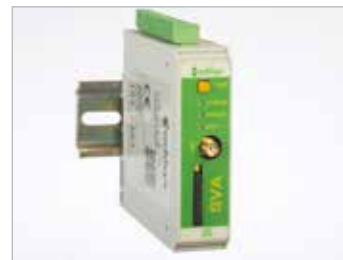
SVA alarm dialler